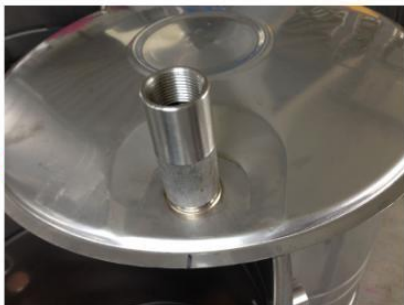
inner tank cover connector welding